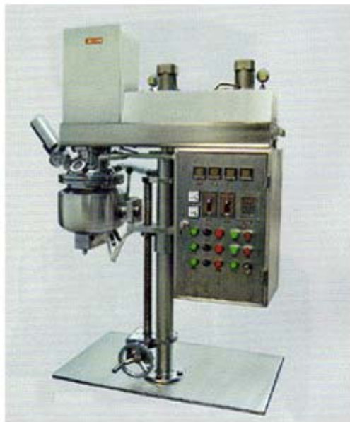
5ℓ용 실험실 유화기