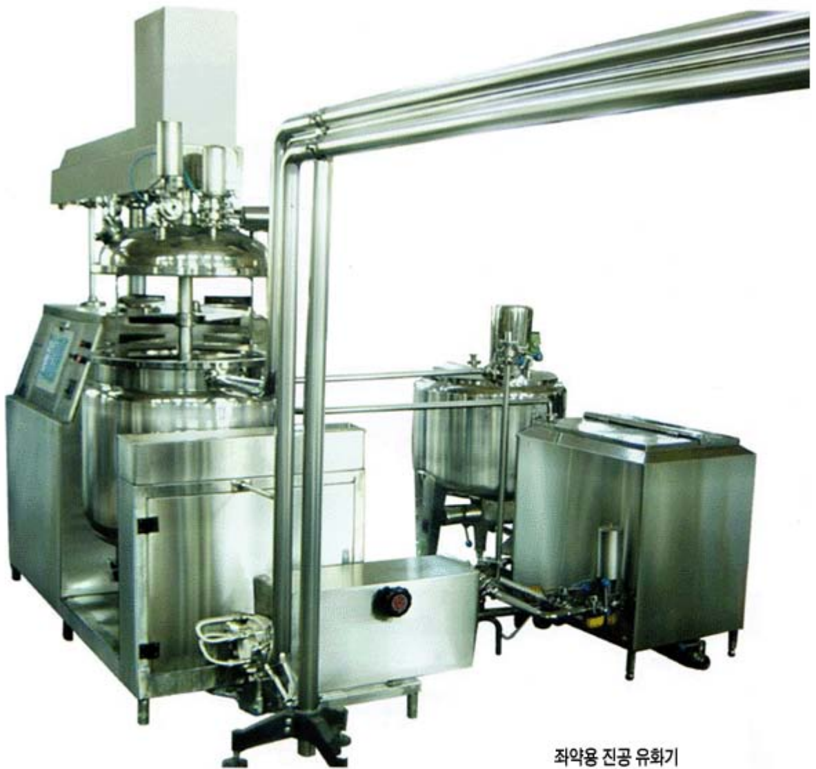
좌약용 진공 유화기