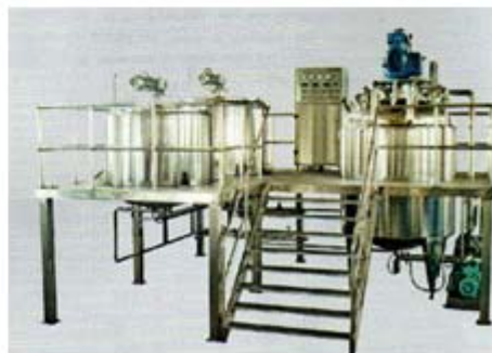
2000ℓ ~ 5000ℓ용 진공 유화기