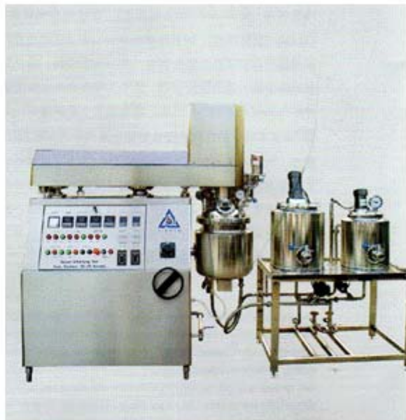
20ℓ 소형 유화기